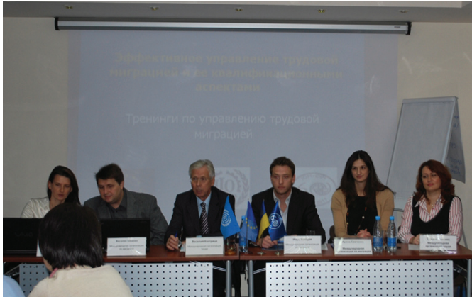
Joint ILO-IOM training on governance of labour migration for ministries, social partners, diaspora organizations (October 3-6, 2011)