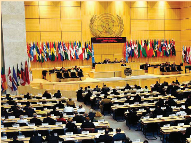
International Labour Conference

Within the UN system, the ILO has a unique tripartite structure with workers and employers participating as equal partners with governments in the work of its governing bodies. With the expansion of labour migration, the ILO has an obligation and unique role to play in developing principles and guidelines for governments, social partners and other stakeholders in labour migration policy and improving practice in pursuit of decent work and social justice for a fair globalization.